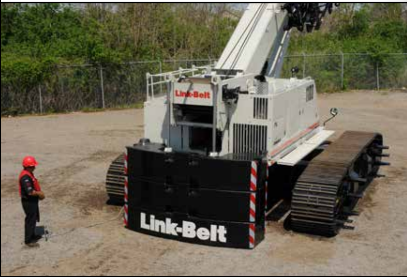
Fast, easy counterweight removal