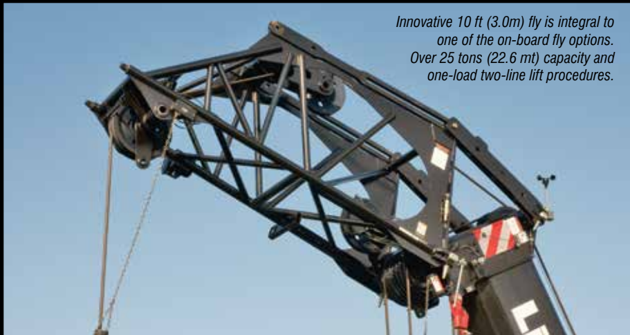
Innovative 10 ft (3.0m) fly is integral to one of the on-board fly options. Over 25 tons (22.6 mt) capacity and one-load two-line lift procedures.