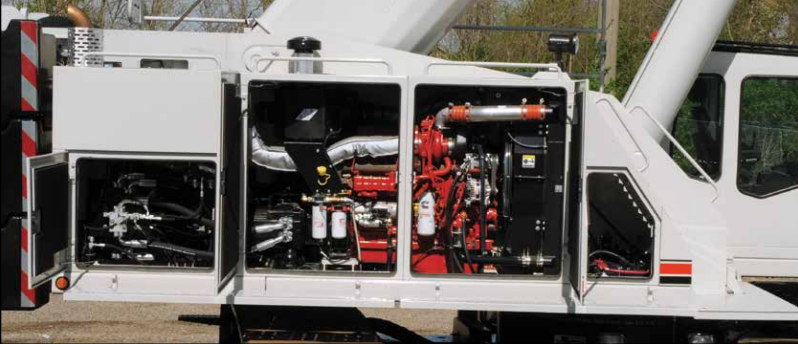
Excellent access for all routine engine and hydraulic maintenance