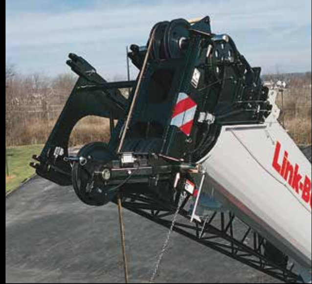
Lightweight nylon head sheaves (including the optional auxiliary lifting sheave shown here) reduce overall machine weight and increase lift capacities.